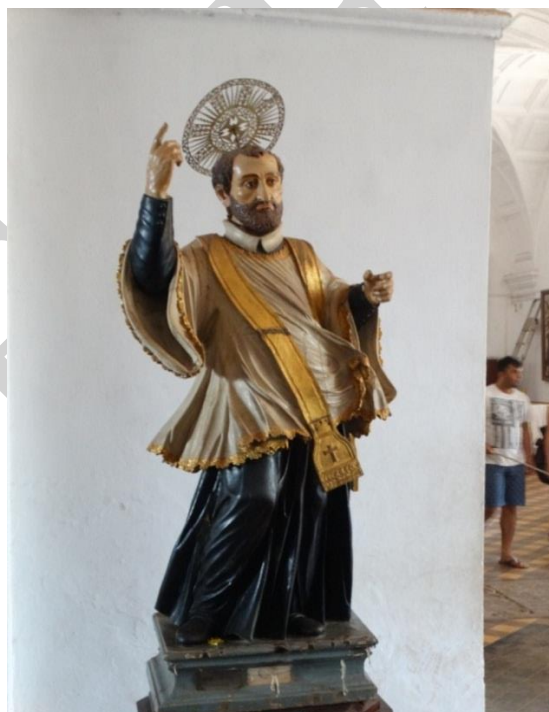
STATUE OF STATUE OF ST. XAVIER

UNESCO World Heritage Site, the “Basilica do Bom Jesus” of Goa (India) was raised to the status of Minor Basilica in 1946. It is also ranked one of the “Seven Wonders” of Portuguese origin in the world in the year of 2009.