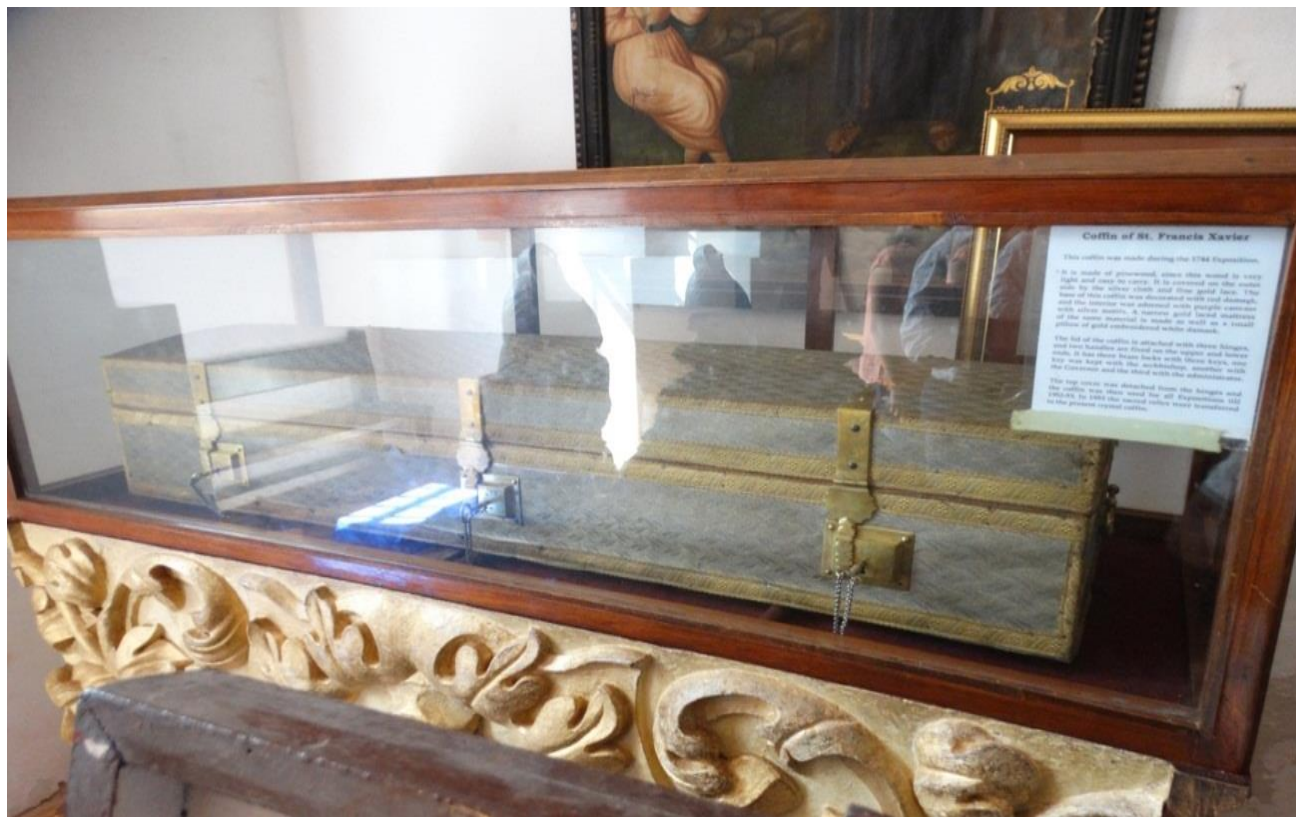
THE CASKET OF ST. XAVIER

Basilica Do Bom Jesus belongs to Minor Basilica categories after the world's Four Major (Papal/Patriarchal) Basilicas: St. John Lateran, St. Peter, St. Paul & St. Mary Major (all in Rome). Minor Basilicas are significant Churches in the world those meet certain criteria & privilege because of their antiquity/dignity/historical value/architectural & artistic worth and or significance as centre of worship. Only 1600 Churches have been honored as Basilica in the world.